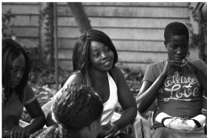
Photo 2.2 Story Circles pilot in Harare, Zimbabwe