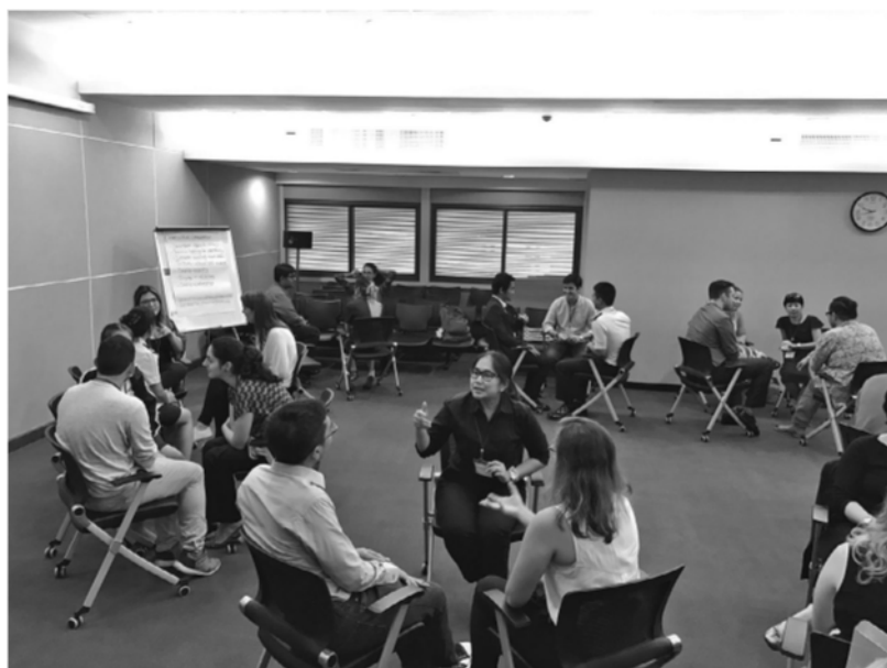
Photo 2.1 Story Circles pilot in Bangkok, Thailand