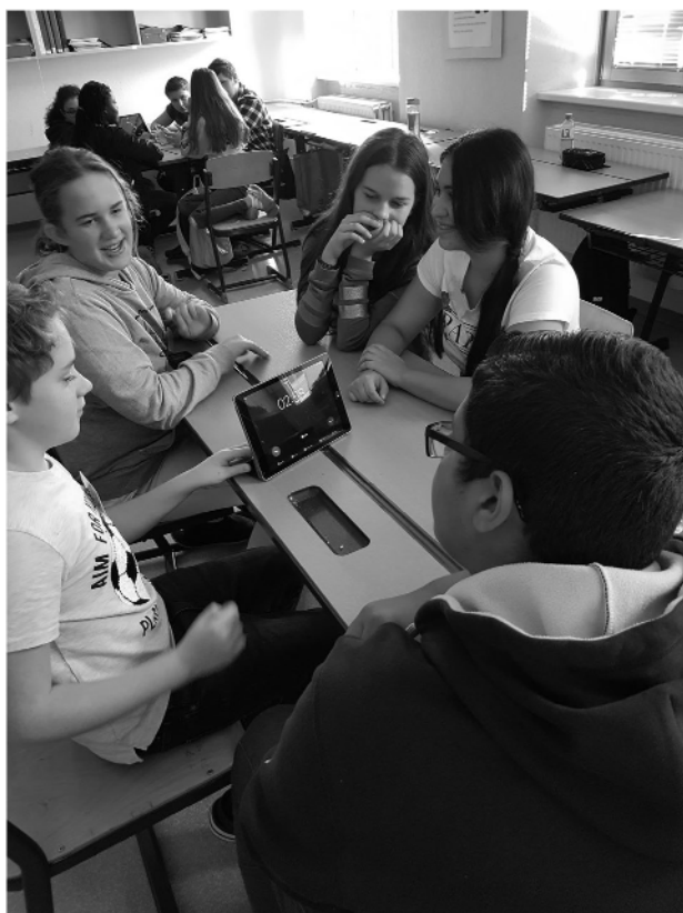
Photo 2.4 Story Circles pilot in Vienna, Austria