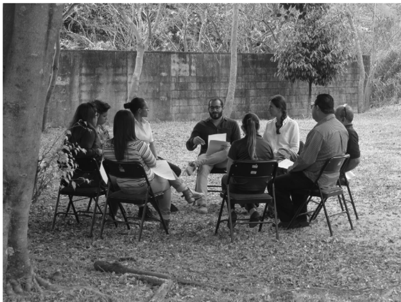
Photo 2.3 Story Circles pilot in San José, Costa Rica

Note that these steps should not be considered rigid and need to be adapted to each context, although there are essential elements, such as the development of guidelines/ground rules as a group, as well as emphasizing the importance of respect of all participants, of equality within the group, and listening for understanding .