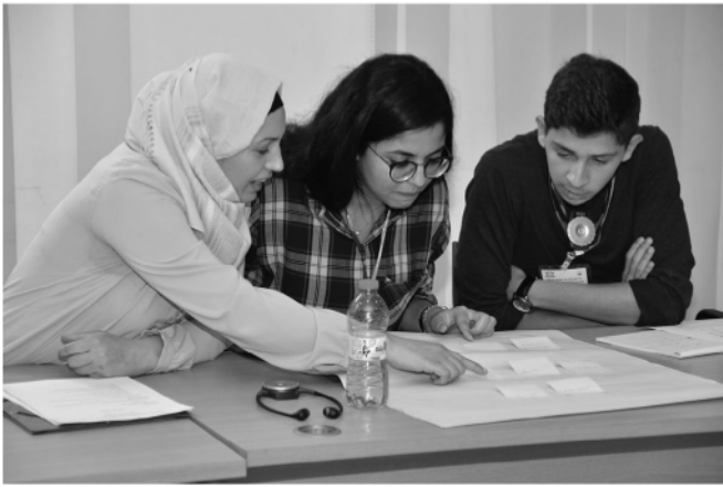
Photo 2.5 Story Circles pilot in Tunis, Tunisia