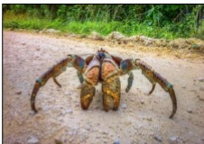
The coconut crab

This crab is really big! It can grow to one metre long! It lives on islands in the Pacific and Indian Oceans. When it is young it finds shells and lives in them, but when it is older it is very strong and doesn't need a shell for protection. It eats fruit and nuts, including coconuts which it finds on the floor. They can live for 60 years! Unfortunately, they are a popular food in restaurants, and there aren't many crabs left.