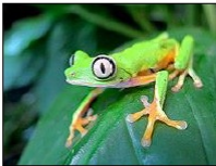
The lemur frog

We know a lot about the big, endangered animals like tigers and rhinos, but there are thousands of animals in trouble. These beautiful animals may not be famous, but they do need our help.