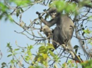
The Popa langur monkey

This funny-looking monkey lives on one volcano in Myanmar. People didn't know it existed until 2020, so we don't know very much about it. But we do know that there aren't many left. It's possible there are only 200 of them! People are building roads and towns through the forests where they live, but the good news is that some of them live in a protected area.